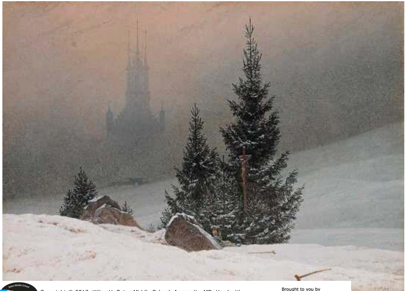
Winter Landscape 1811 by Caspar David Friedrich

From the Renaissance until the 20 th century, virtually all artists shared one basic belief: that a flat, 2-D painting should create an illusion of 3-D space , as if it were a window opening onto a real-life scene