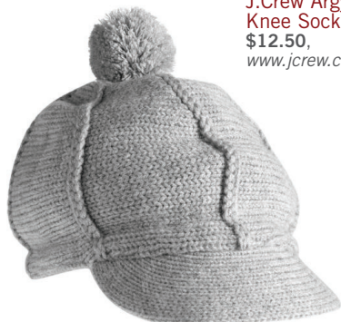
Pom Pom Brim Beanie $24.50, www.gap.com