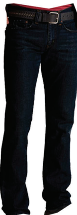
Levi's Skinny 511 Jeans $44, www.levistore.com