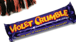
Violet Crumble $21 for 24, www.candydirect.com