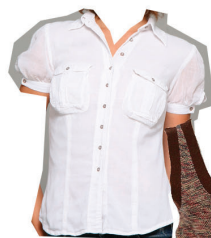
Da-Nang Cotton Woven Shirt $128, www.couture-candy.com