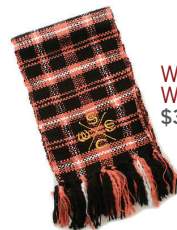
WeSC The June Woven Scarf $30, www.karmaloop.com