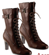
Aerosoles Pretty Up Boots $75, www.aerosoles.com