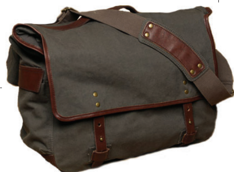
J.Crew Great Point Messenger Bag $95, www.jcrew.com